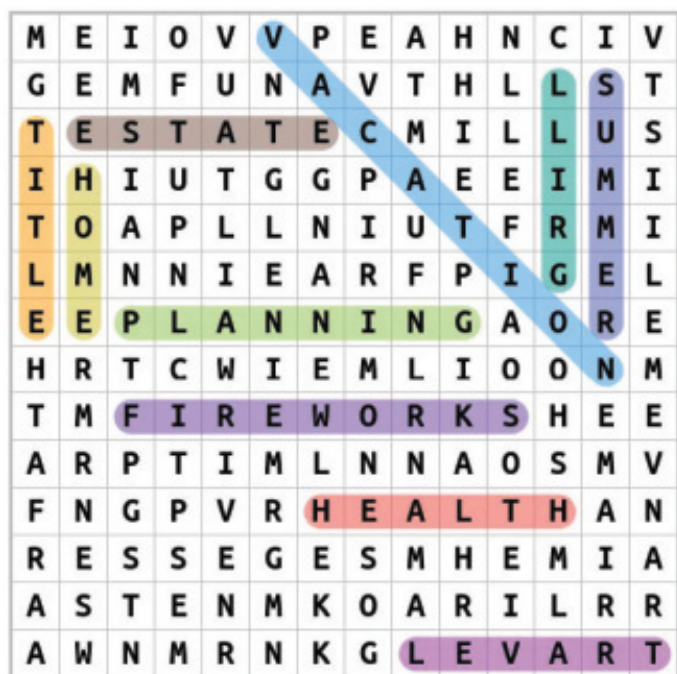
July Puzzle Answers